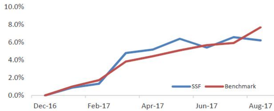
Year to Date