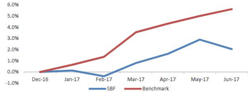
Year to Date