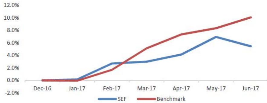
Year to Date