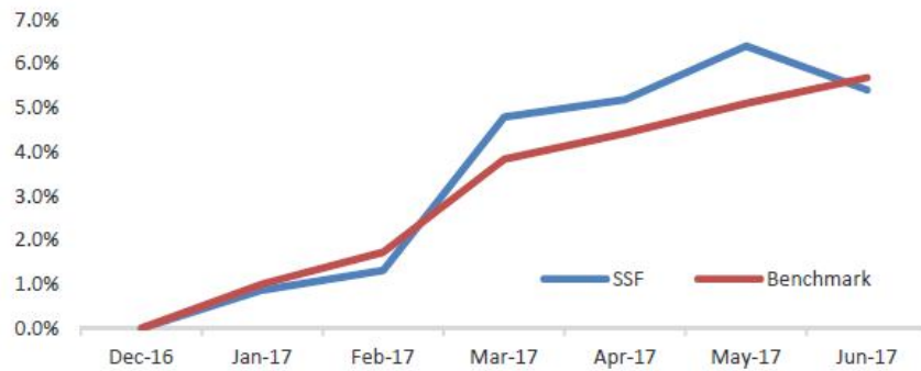
Year to Date